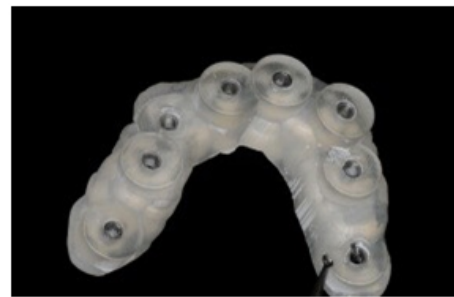
Figure 1: Surgical Guide.

Dental patients look for various options for maintaining long lasting oral health. Implants offer a viable solution for replacing missing teeth with no need to do away with surrounding healthy dentition. By traditional practice, it required patient undergoing set of preparations on adjacent healthy teeth for constructing a bridge. Though this process fulfills the requirement of replacing a tooth, this process has to cut tooth structures of healthy teeth adjacent to missing tooth. Dental implants have removed this requirement and thus are offering a more conservative solution for replacement of missing tooth. The clinician places an implant into site of missing teeth without causing any damage to the adjacent healthy teeth. Placing of the dental implants requires some special considerations taken prior to the process. It is required to ensure that location, size of implant and angulation should be appropriate and also specific to site; the clinician has to take into consideration of biomechanics of bone density, nerves and sinuses of the patient. 1,2 Conventional surgery was done by hand or the surgical guides were prepared on solid gypsum stone models or used dentures fabricated in laboratory and holes were drilled prior to guide the hand piece of the surgeon. With advancements in digitization and cone beam computed tomography (CBCT) scan, it is now possible to perform truly guided surgery (Figure 1).